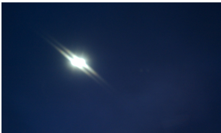
on May 7, 2011 on I-70 at Odessa

The events were reported to the media and Chanel 5 News interviewed me about it then ran the