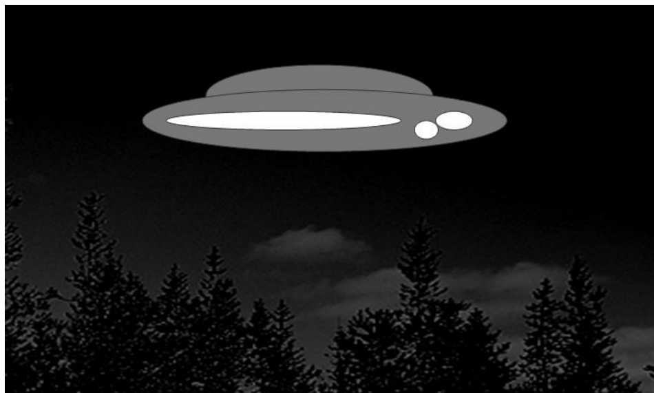
Drawing of a large silver metallic disc-shaped object over Lee's Summit, Missouri